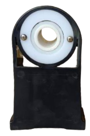
**Black color is for demo only. The actual color is purple blue**